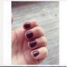
summer ephhational 17